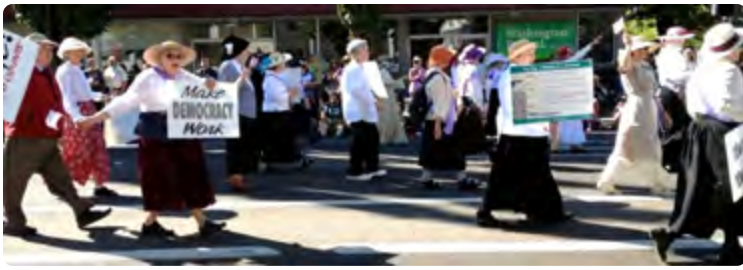
Still marching for change, LWVLC participated in the March for Our Lives in support of preventing gun violence.

to put a measure on the ballot delaying construction of a nuclear power plant in the Willamette Valley. The measure was passed, and the project shelved.