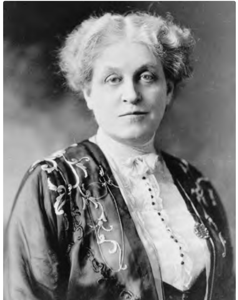
Carrie Chapman Catt founded the League of Women Voters

In 1965, the LWVLC brought together public and private social services to address the need for affordable day care. In 1968, a community-supported affordable day care center opened. In 1970, the LWVLC circulated a petition