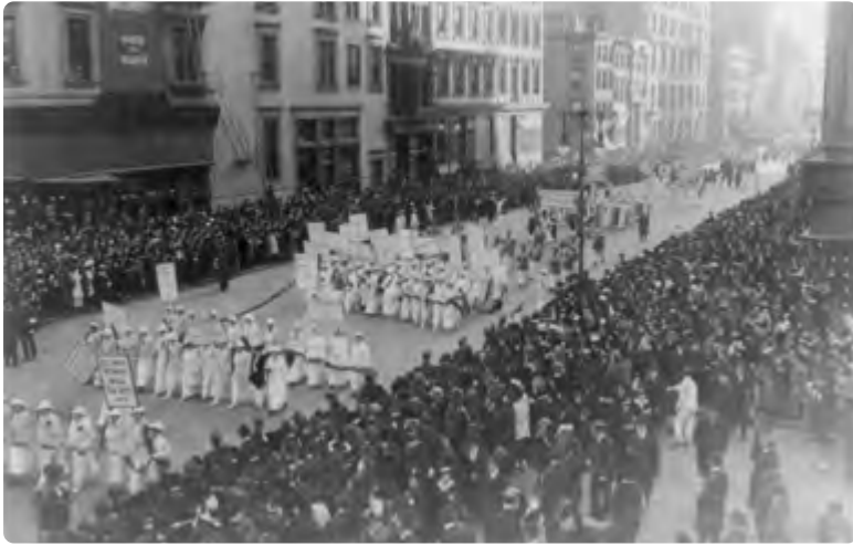
In their 72-year fight for the right to vote, women marched to draw attention to their demand.

For 72 years, women in the United States lobbied, campaigned, wrote letters, marched in parades, held sit-ins, and were even imprisoned in their fight for the right to vote. When the 19 th Amendment to the U.S. Constitution was finally approved on August 26, 1920, the political power of women voters was unleashed.