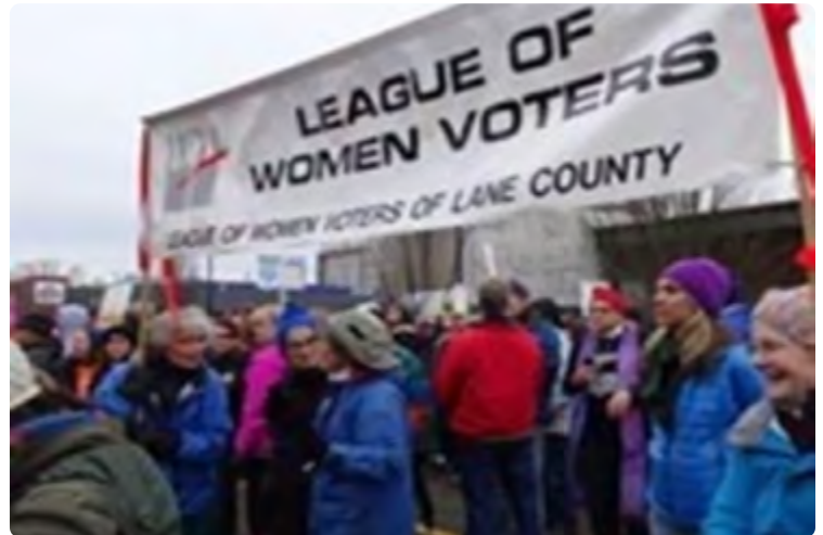
Women are still marching but now it is with the knowledge that they are a formidable voting bloc.

The Lane County History Museum's exhibit, Equality and Nothing Less: 100 Years of the League of Women Voters opens on February 7, 2020. Several other events commemorating the League's 100 years will be presented throughout 2020. Visit www.LWVLC.org for details.