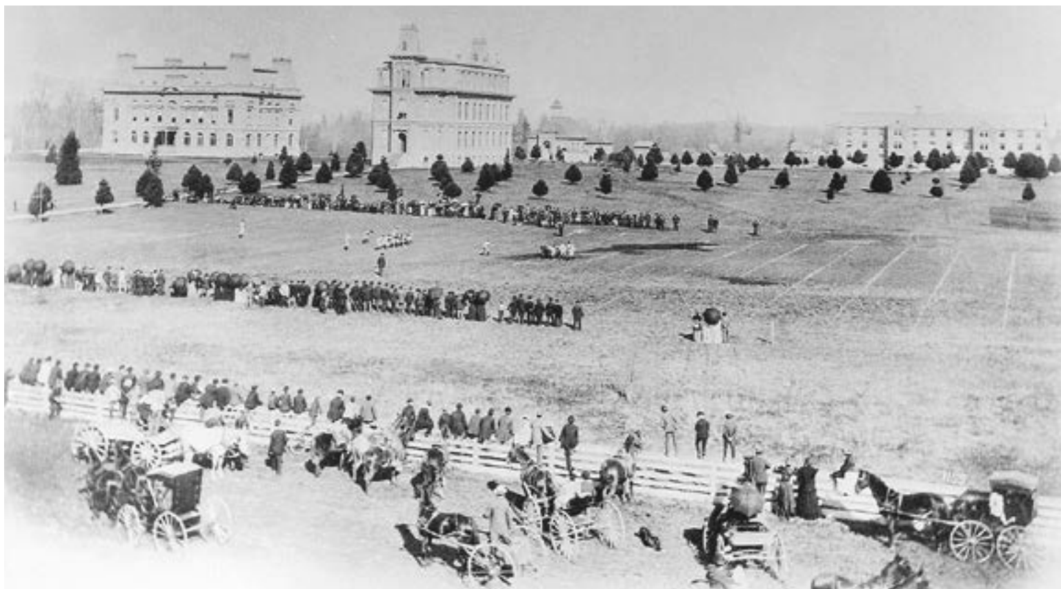
Above: GN6054, The University of Oregon's first football game on March 24, 1894.

points at the time), and making 6 of the extra-point kicks (worth 2 points each). Albany's only points came on a Safety. The final score was Oregon 44, Albany 2.